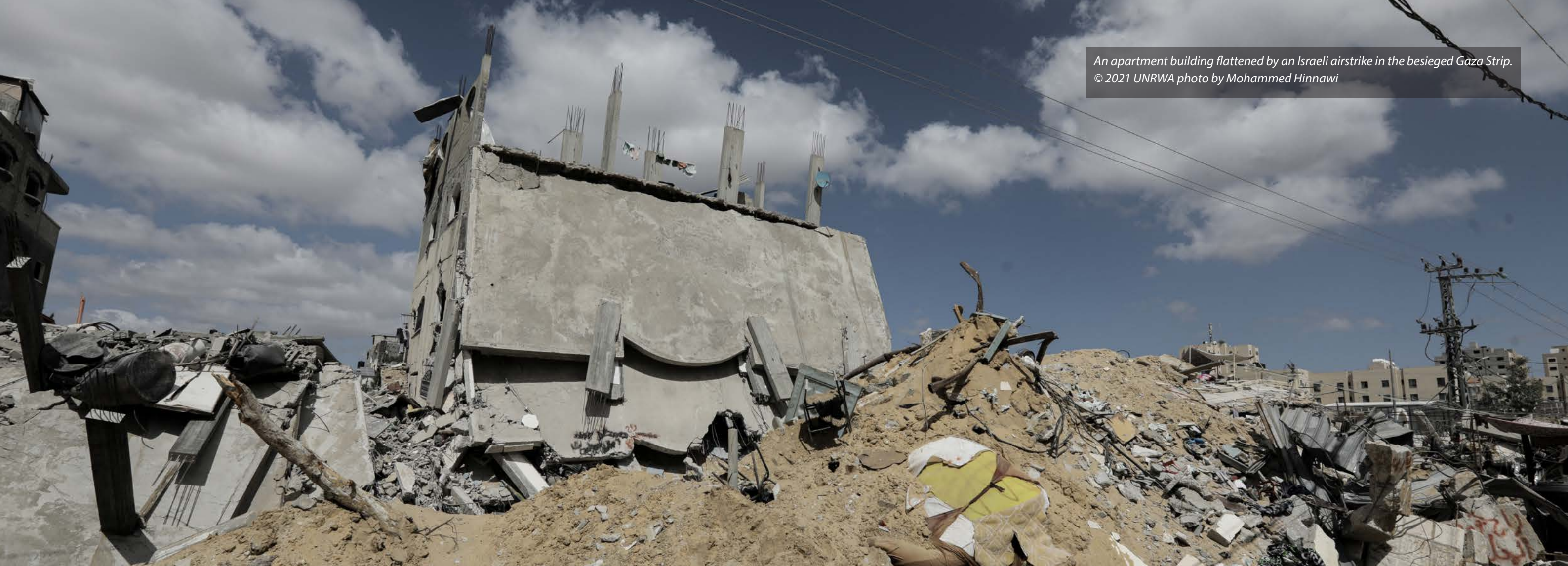
An apartment building flattened by an Israeli airstrike in the besieged Gaza Strip.