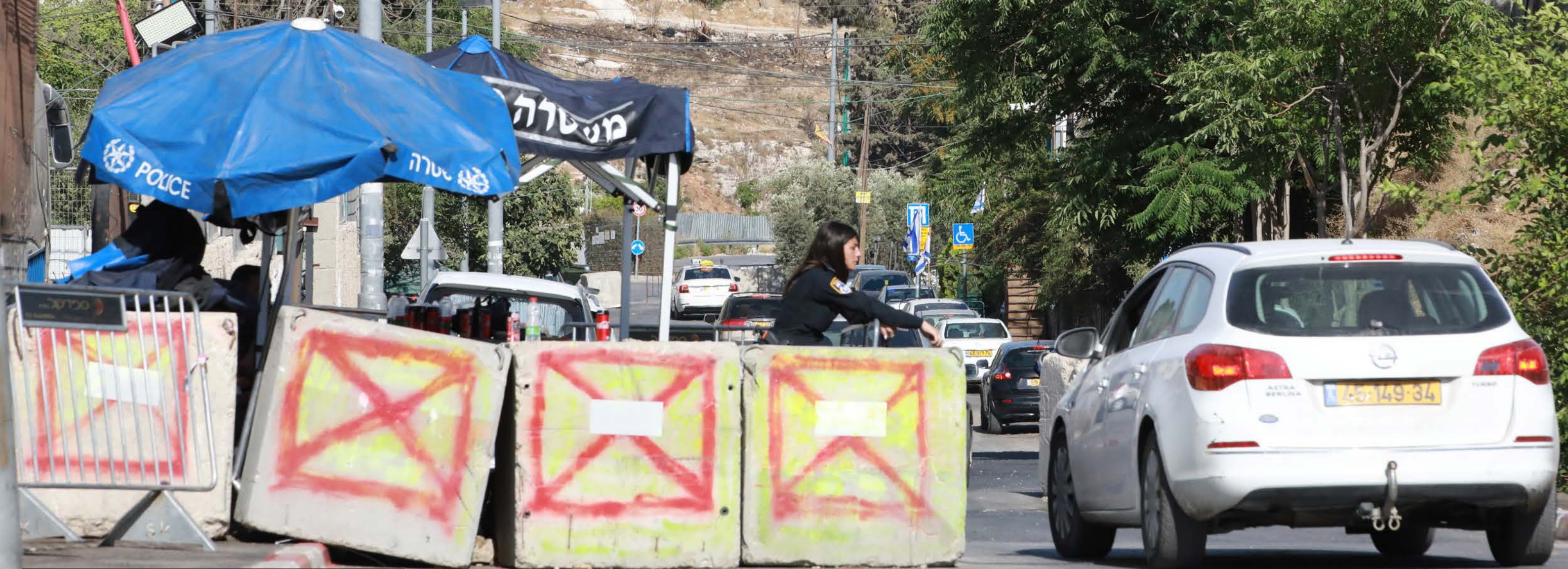
An Israeli Police checkpoint in the Sheikh Jarrah neighbourhood of occupied East Jerusalem.

receive on average US$ 1,300 (support will vary based on type of response).