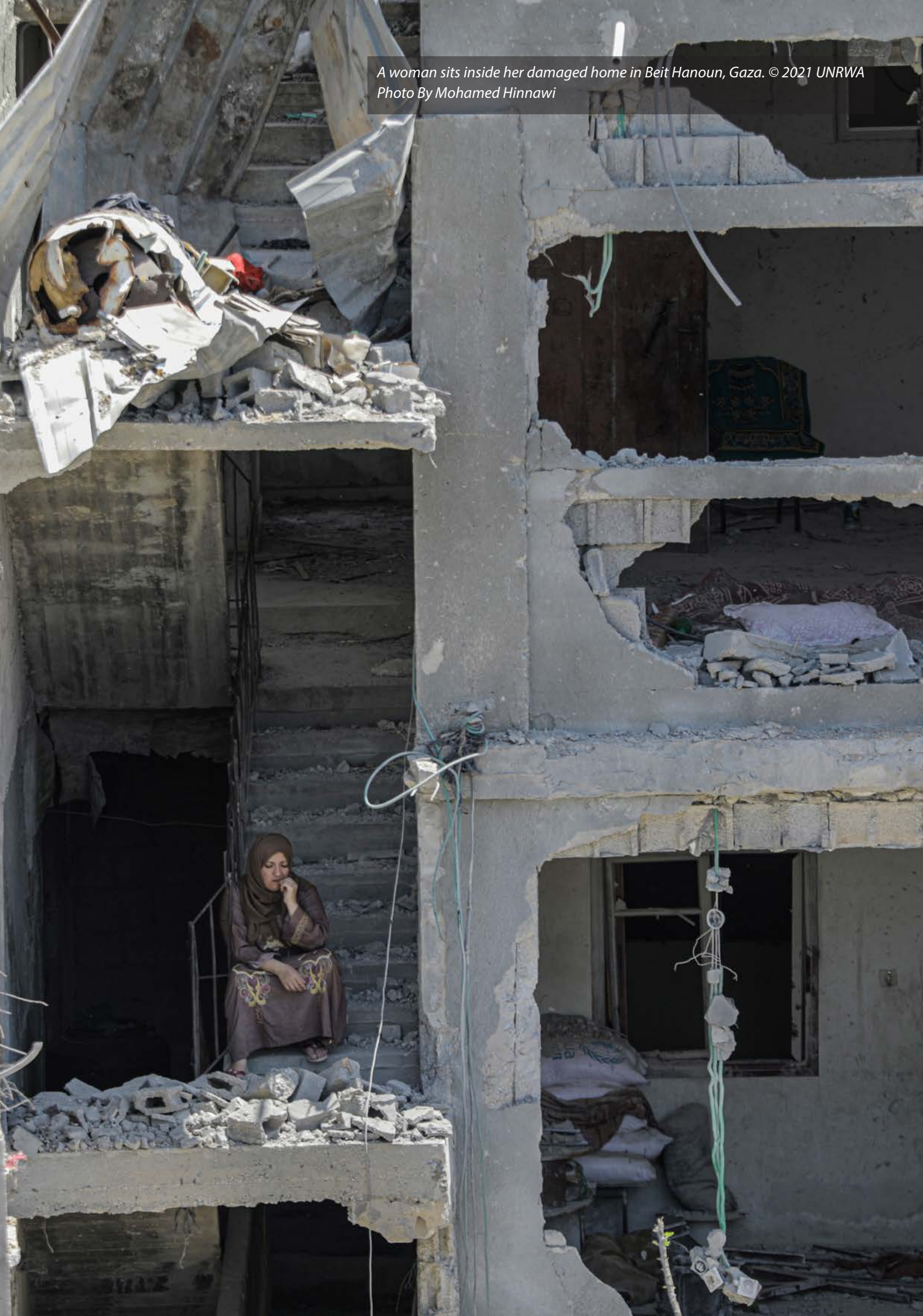
A woman sits inside her damaged home in Beit Hanoun, Gaza.

IT and security infrastructure and (solar) electricity supply.